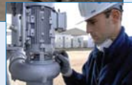
Each BAC part has unique technical specifications