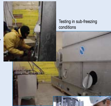
Testing in sub-freezing conditions

That's why BAC is your best partner to replace parts if you want the longest equipment operating life and minimum repetitive downtime .