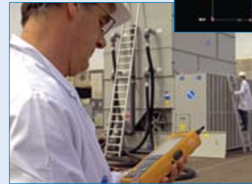
Temperature testing on a cooling tower

That's why BAC is your best partner for replacing components if you want to ensure efficient operation and optimal, original performance .