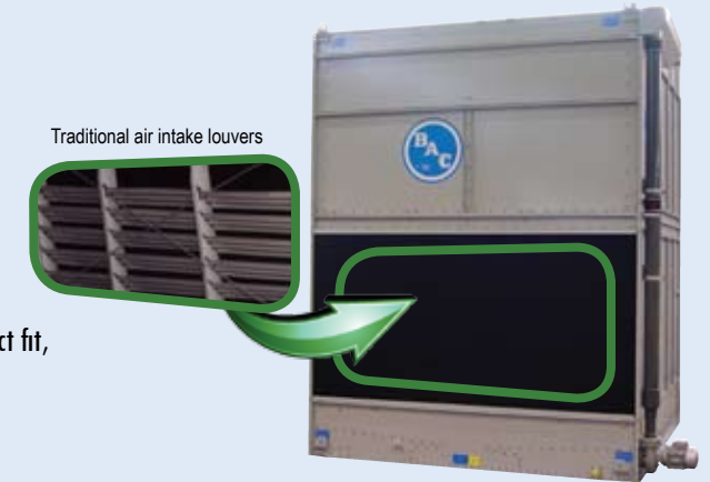
Traditional air intake louvers

When buying spare parts from BAC you can count on high-quality components that keep pace with the latest technology .